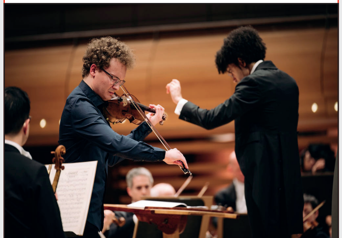
Dmytro Udovychenko of Ukraine – 1st Prize Laureate, 2023 Final with the Orchestre symphonique de Montréal

Follow the artists at each stage and witness the triumph of the laureates and prizewinners.